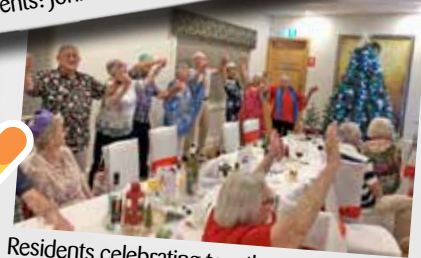
Residents celebrating together