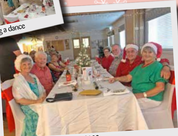
Resident Christmas Dinners 2022