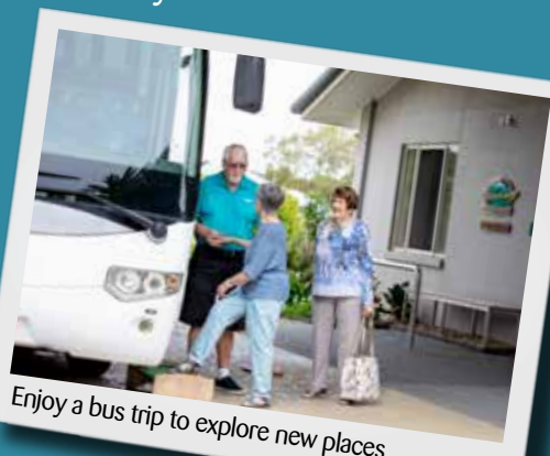
Enjoy a bus trip to explore new places

Here are five main reasons given by retirees for choosing to move from the family home into a retirement community.