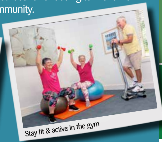
Stay fit & active in the gym