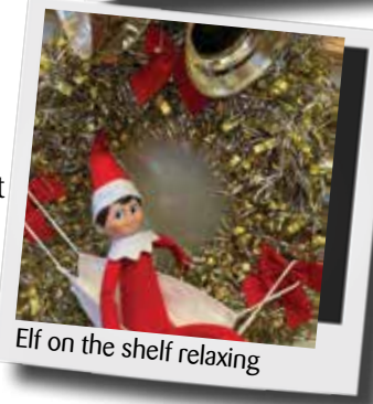
Elf on the shelf relaxing