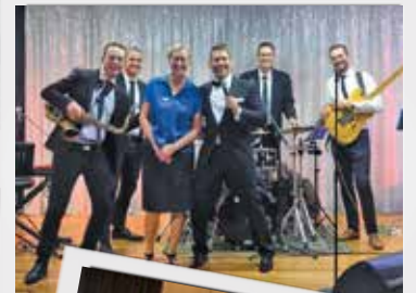
Portofino Fashion Show