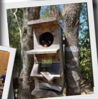
New wildlife residents