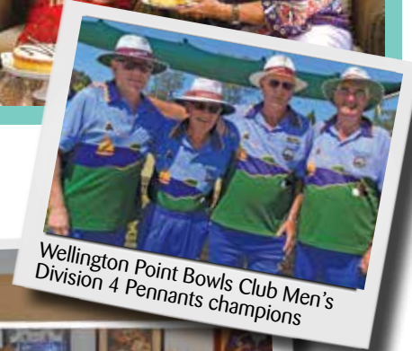
Wellington Point Bowls Club Men's Division 4 Pennants champions

We would like to wish everyone a Very Merry Christmas and safe, peaceful New Year!