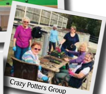
Crazy Potters Group