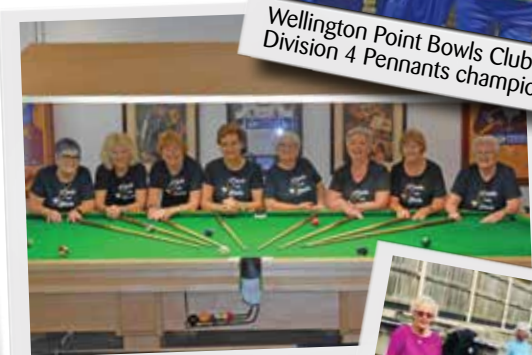
Chicks with Sticks