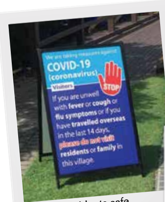
Keeping residents safe