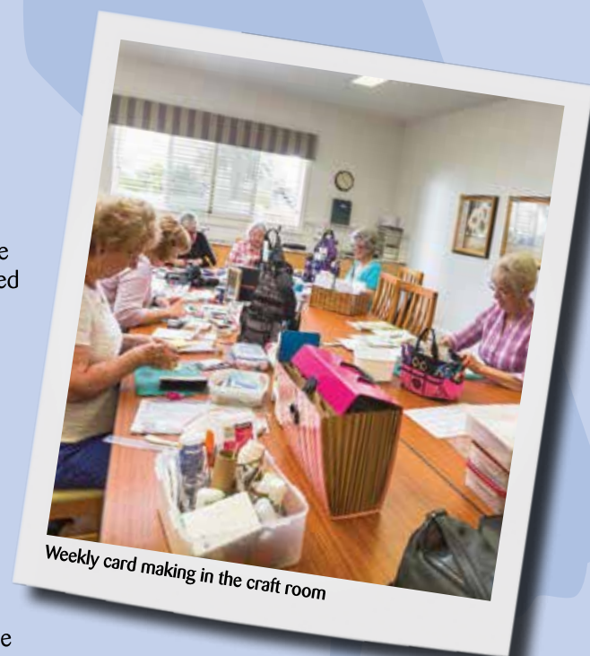
Weekly card making in the craft room